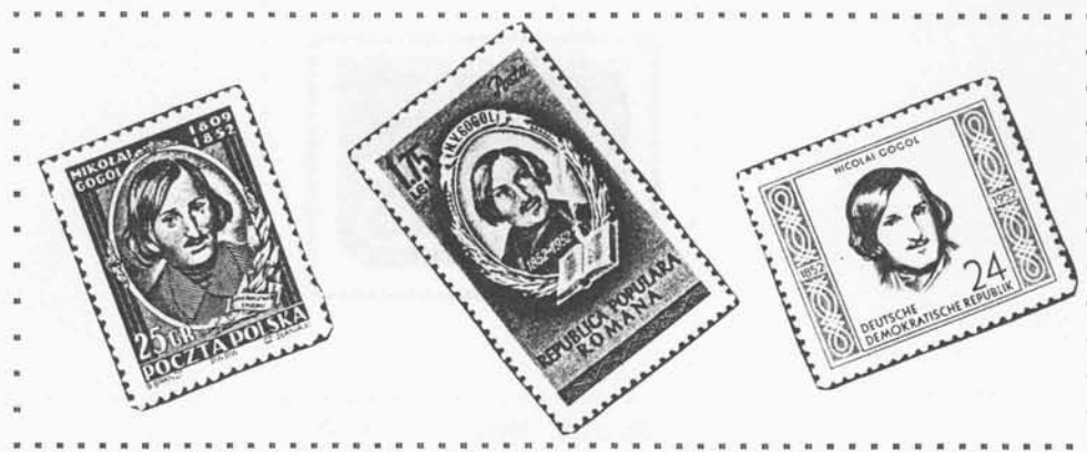
Scott No. 544