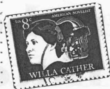
Scott No. 1487

The Lambda Philatelic Journal is published quarterly by The Gay and Lesbian History on Stamps Club, an official study unit of the American Topical Association, membership number 458. We have been serving the gay and lesbian philatelists since 1982.