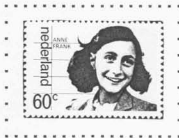
Scott No. 598

The following article appeared in the August issue of the "The Body Politic", a Canadian national gay newspaper: