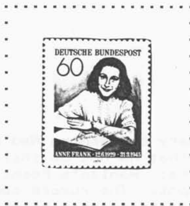
Scott No. 1293

Anne Frank perished in the Nazi concentration camp at Bergen Belsen after her family's hiding place was discovered. Her diary was saved by her father and has been published in more than thirty countries, selling sixteen million copies. An English translation of the whole diary is expected soon."