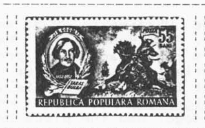
Scott No. 879

In 1836 Gogol left Russia for Italy. Here he composed his most outstanding work, Dead Souls , and openly pursued a sexual relationship with a young man. Dead Souls is a sweeping tour de force of Russian "types" and mores, portraits drawn both with a relentless and biting sarcasm, and a profound insight alleviated by a loving tenderness for his mother country left behind. His love affair, however, was not nearly as successful as his novel.