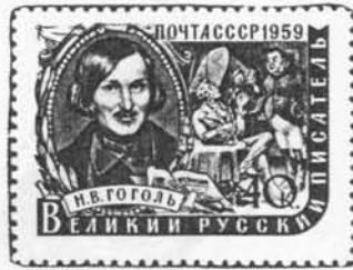
Scott No. 2178-A

Gogol was given a teaching post in the History Department of the University in St. Petersburg in order to earn money to support himself and his writing. He had developed a theory of "Universal History," and after an initially brilliant series of three lectures, he quickly ran out of ideas. He cancelled lectures. He pleaded laryngitis or other illness. He showed up disheveled and offered a few incoherent remarks. Needless to say, Gogol became something of an embarrassment to the University and he was asked to resign his post.